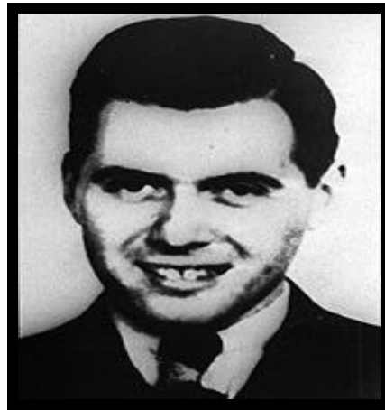
Dr. Josef Mengele